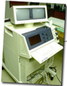
Advanced diagnostic imaging such as ultrasound may be required